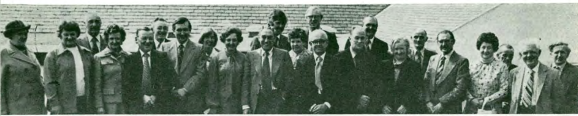
Gwynedd District long service staff with their guests and senior officers pictured after the presentation ceremony