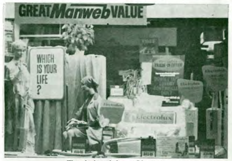
The winning window at Llanrwst

and their wives, who organised an entertaining motorised treasure hunt recently.